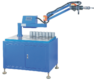
SU Standard Arm Universal Head Machine ( Order Code 'SU' )