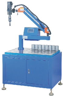
SV Standard Arm Vertical Head Machine ( Order Code 'SV' )