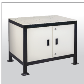
Working Table : 900x600x700. Designed with heavy duty box section frame and 12mm thick machined top surface. Powder coated with arrangement of castor mounting.