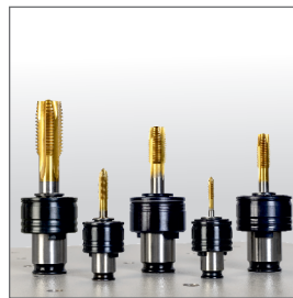
Quick Change Safety Tap Holder : Torque slip clutch collets ensure controlled torque while tapping and avoid tap breakage.