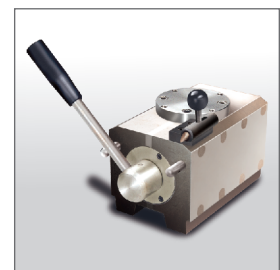
Magnetic Base : 250x100x190mm Lifting capacity 300/500/1000Kg For easy mounting of machine on large plates and heavy jobs.